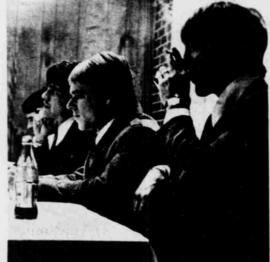
DAVE CLARK AND FIVE friends of his met the press in Raleigh Thursday at the Holiday Inn before their concert in Reynolds Coliseum. They smoked and chatted with reporters as long as their manager could stand it, then took a break for the show.