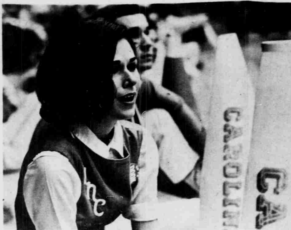
. . . Disappointment . . .