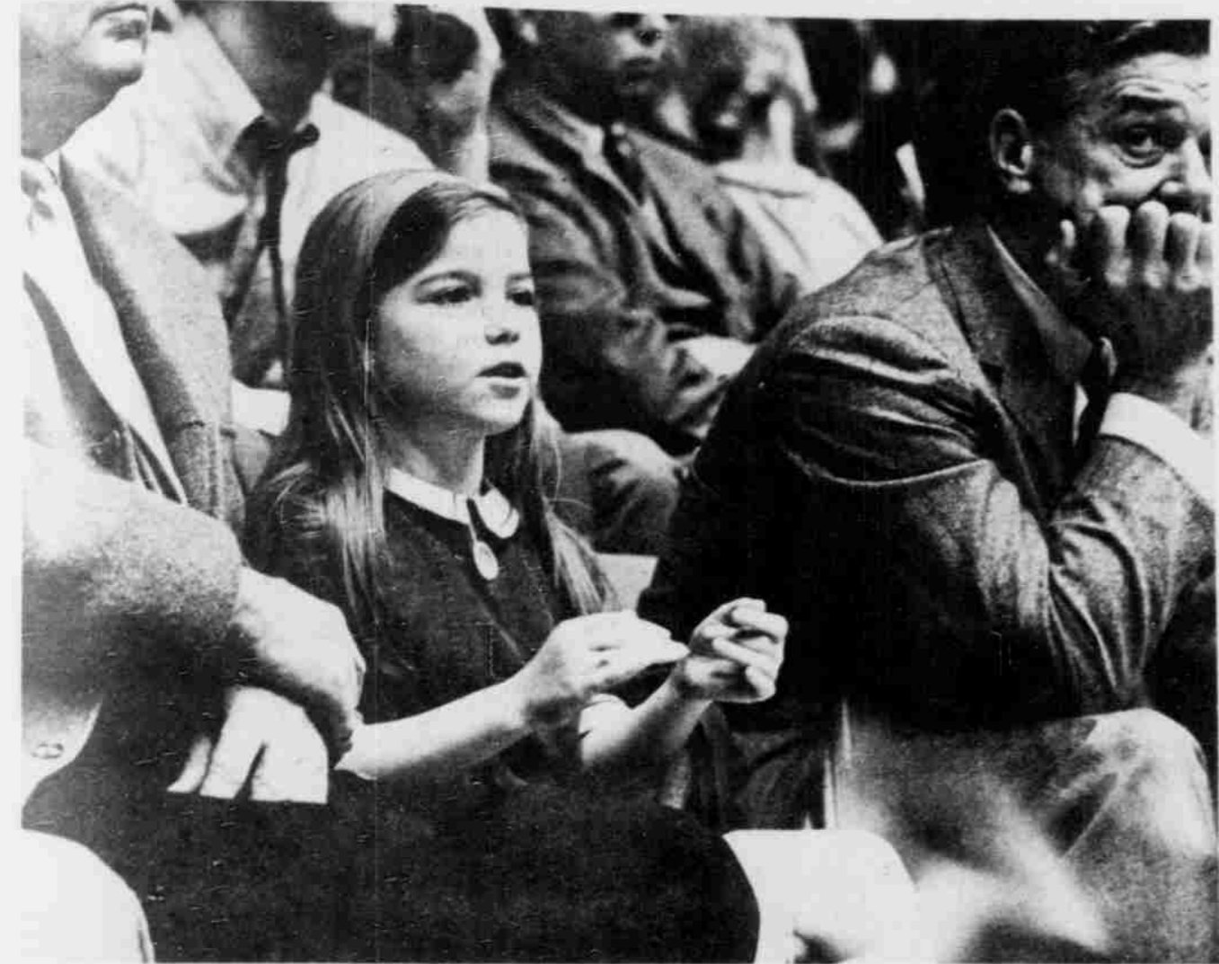
. . . Tense Moments . . .

When the final buzzer sounded yesterday it didn't really feel like the game had ended. Puzzlement, weariness, shock and just plain anger are shown on the faces of UNC cheerleaders and students in these pictures. The Duke game meant a lot, and we fought hard, but the team was no less disappointed than those who watched them, on TV and in Carmichael Auditorium. UNC gets one more chance with the Blue Devils in Durham on Feb. 26.