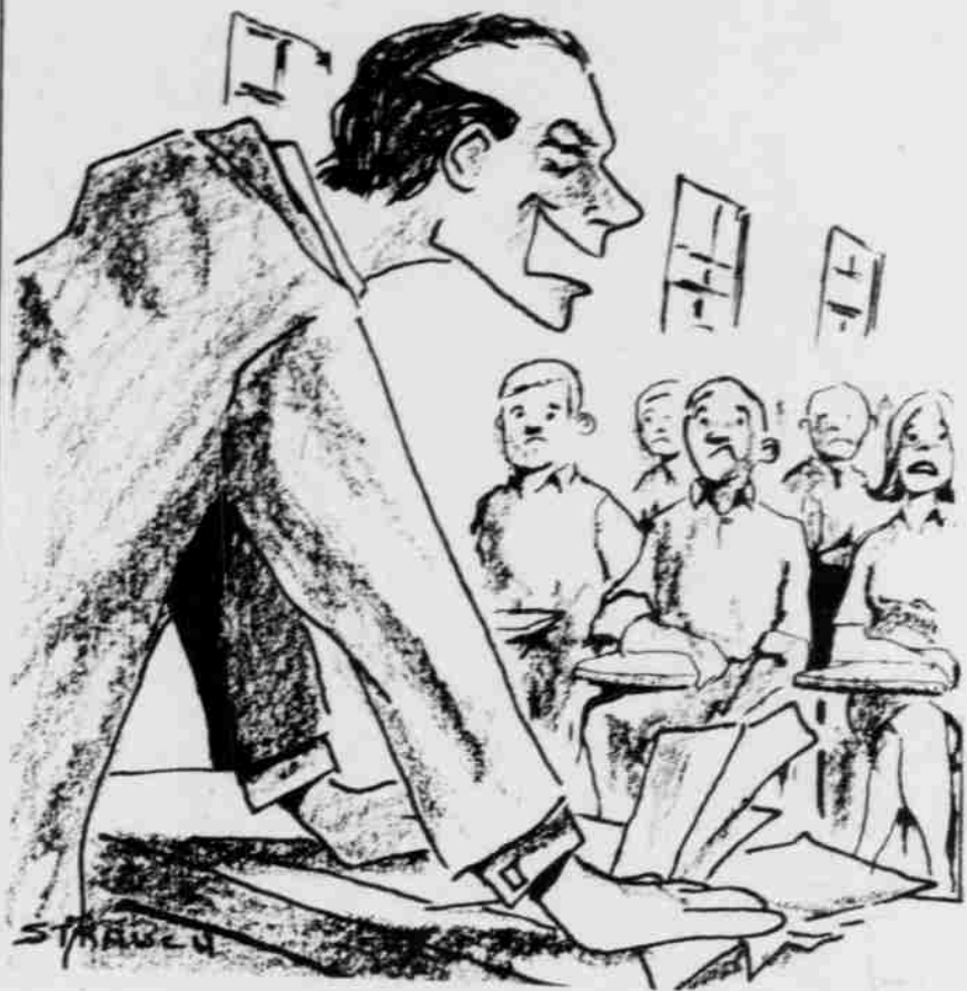
"Now that I know professor probation is only a rumor, you're all going to flunk!"

The child care center is a non - profit organization established through a grant supplied by an anonymous layman associated with a child care organization.