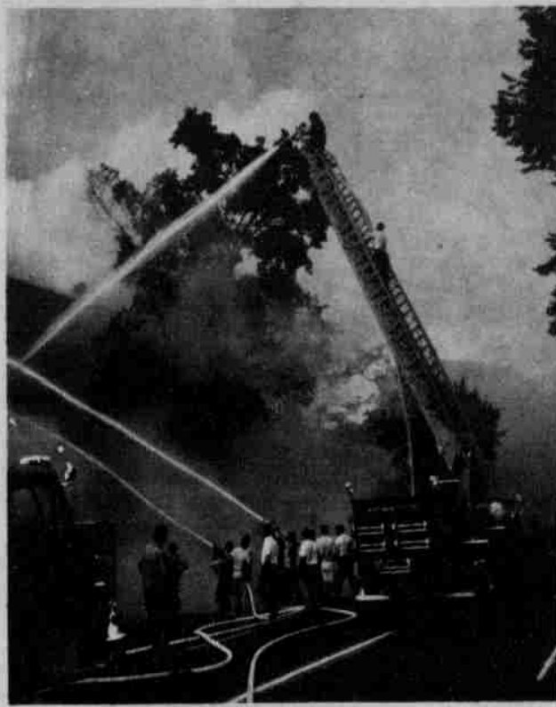
Water Goes In