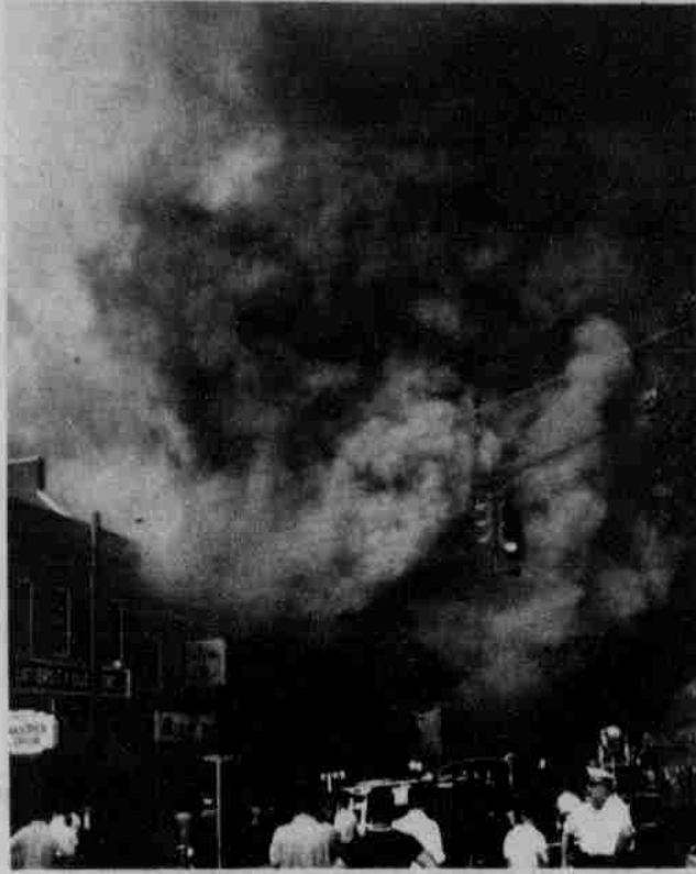
Smoke Rolls Out