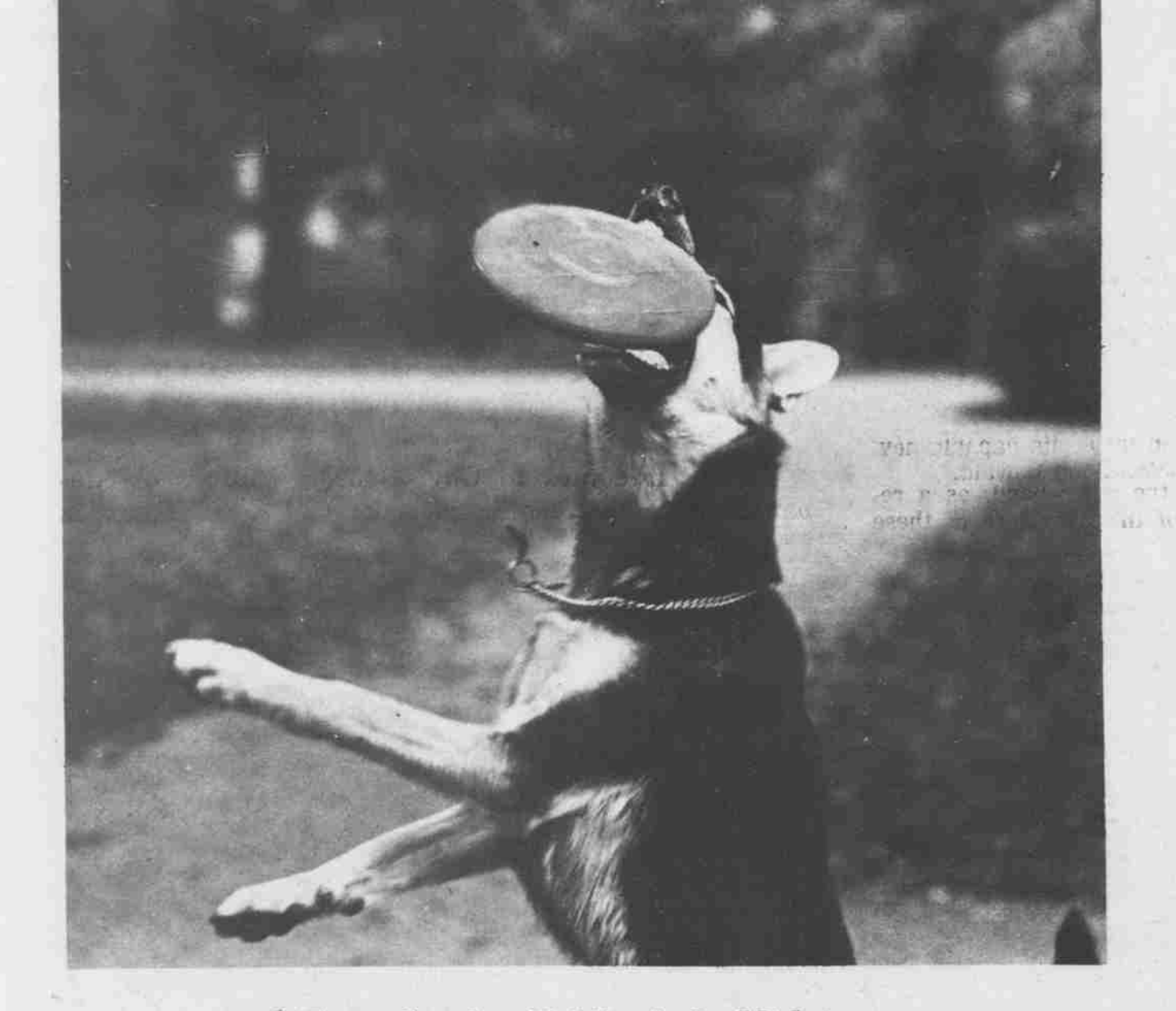
Even Catches Frisbee's In Midair