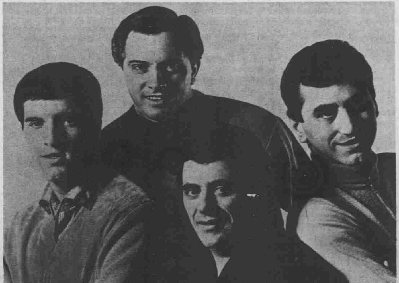
The Four Seasons

Probably the "swingingest" group on the "pop music" charts today, The Four Seasons, will be here at 8 p.m. tonight for Duke Weekend. Made famous by their hit "Sherry" in 1962, they have jumped to stardom in just a few years. Within a month after it was released, "Sherry" became a hit and soon sold over a million copies and earned the group its first gold record. From then on the hits continued including "Big Girls Don't Cry," "Walk Like a Man," "Ain't That A Shame," "Candy Girl" and many more. Their albums have been equally famous and have sold many millions. All members of the groups are from New Jersey and began their ascent to the "top forty" in 1960 when they combined their talents and formed a new musical and vocal team. They demonstrated their abilities in a small New Jersey night club from which they borrowed their name — The Four Seasons.