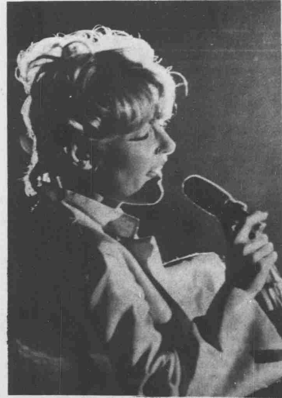
Petula Clark highlighted Jubilee entertainment last night. The

seats to offer the Chapel Hill be entirely different. Specific projects of the UP The "new UP" doesn't plan are to be announced next week to compete with SP. It is to Levy said.