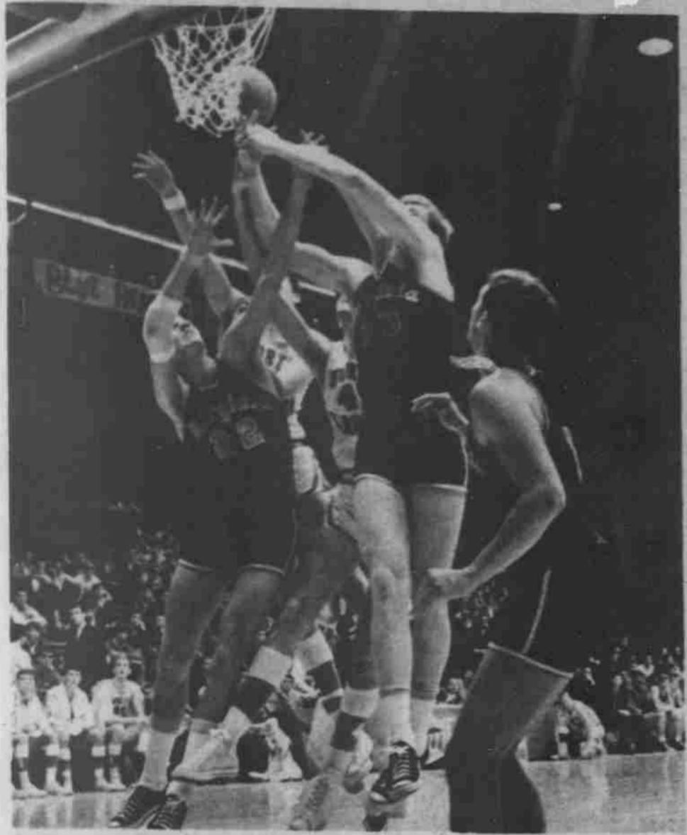
Carolina and Virginia struggle for a rebound ... Carolina won 80-60.