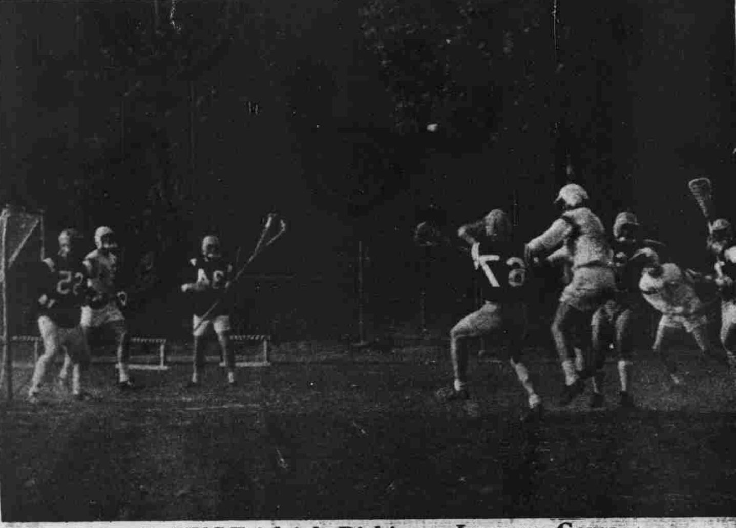
Action In UNC-Fairleigh Dickinson Lacrosse Game ... Which North Carolina Won Easily, 9-4