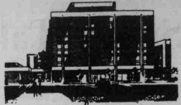
Northwestern Mutual Life Ins. Bldg.

VISIT OUR BEAUTIFUL NEW LOCATION IN UNIVERSITY SQUARE