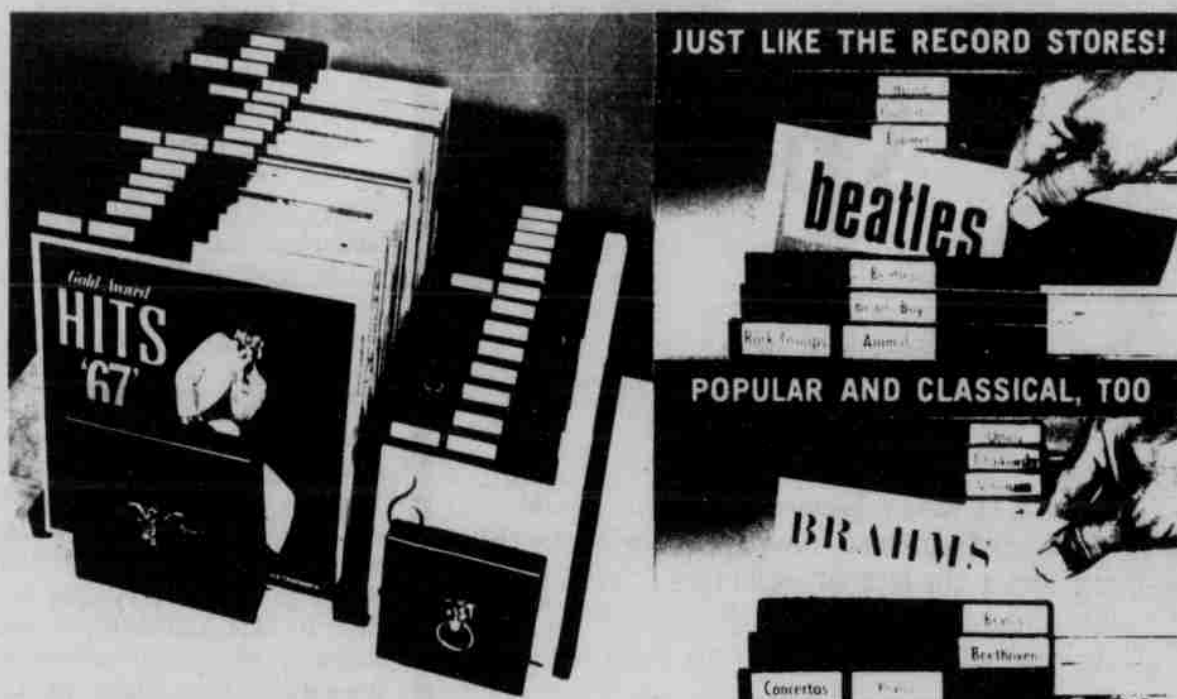
LP Stand (Holds over 100 Albums), $9.95. Tape/45 Version, $9.50. See description below.

Fri., Sat., Sun., Mon., Tues., Wed. 1:45, 4:05, 6:25, 8:45