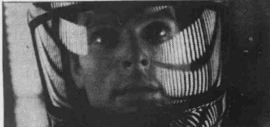
MGM PRESENTS A STANLEY KUBRICK PRODUCTION