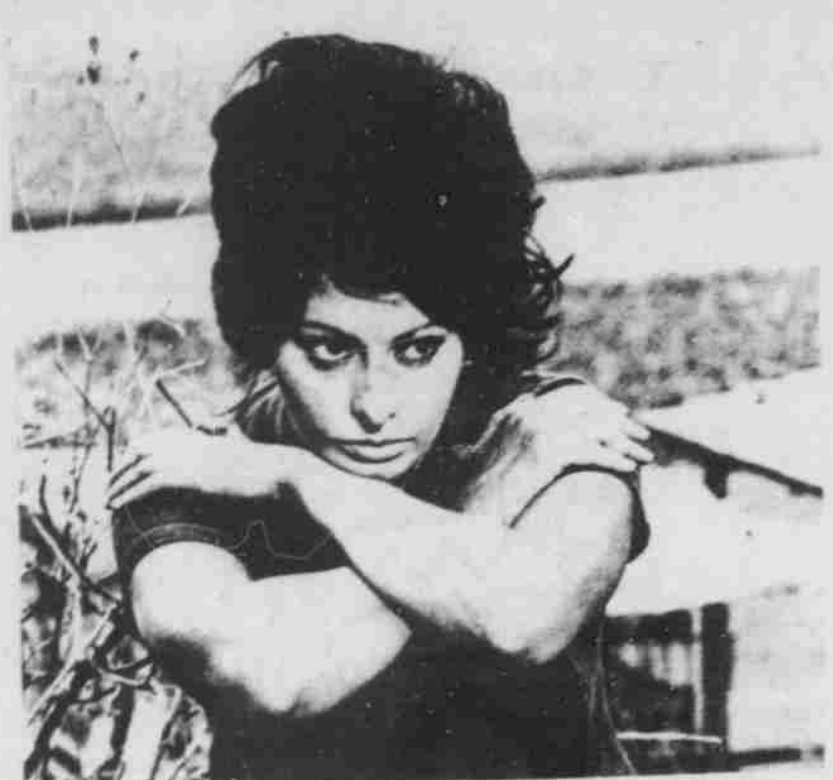
SOPHIA LOREN, AT 9 P.M. WEDNESDAY