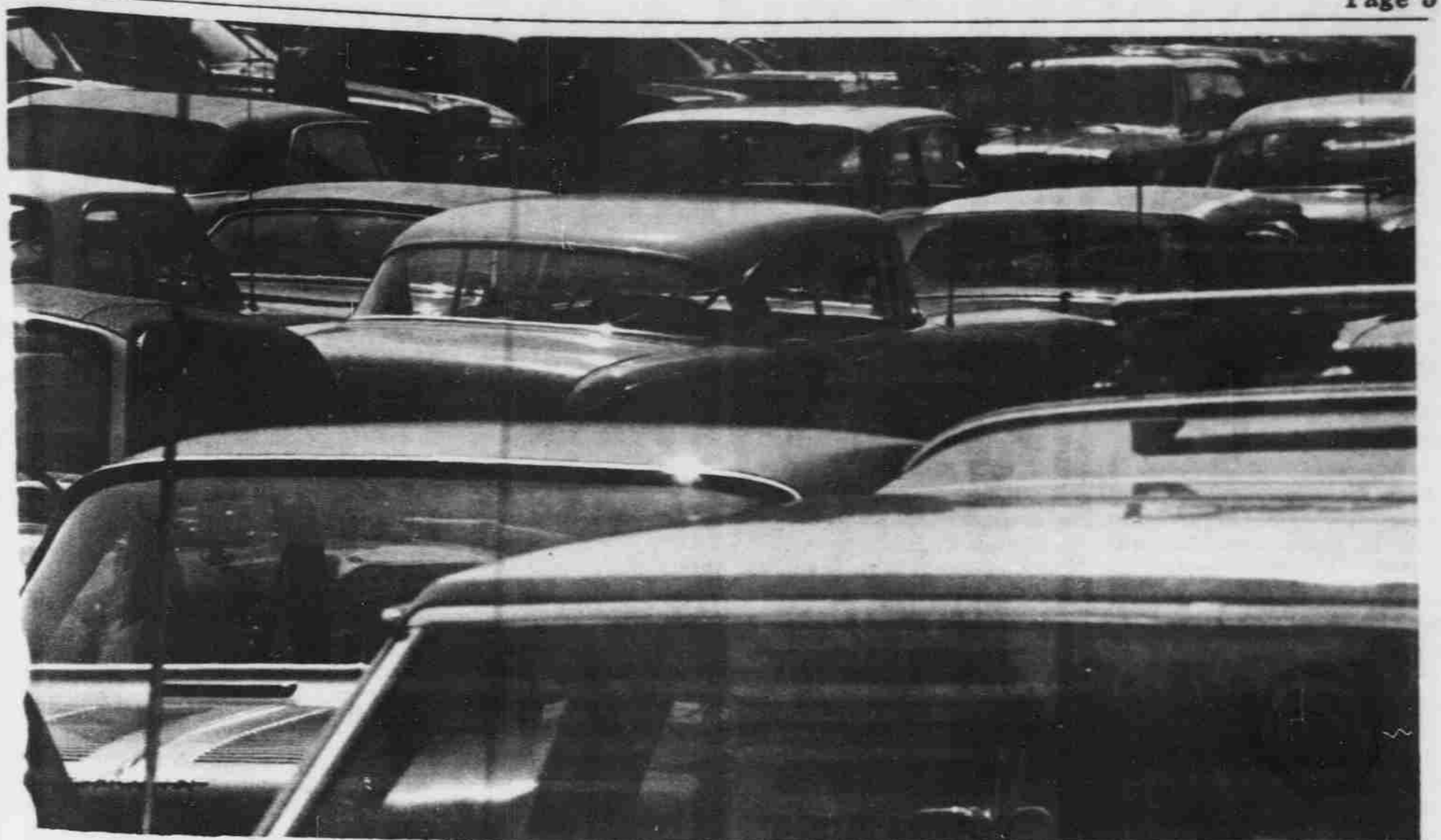
PARKING SPACES—seem to be getting scarcer all the time, and on certain weekends the only answer is to squeeze in wherever there's any kind of room at all. This kind of weekend is called the football special, known in the winter as the basketball special, which means you measure the space between cars in millimeters.