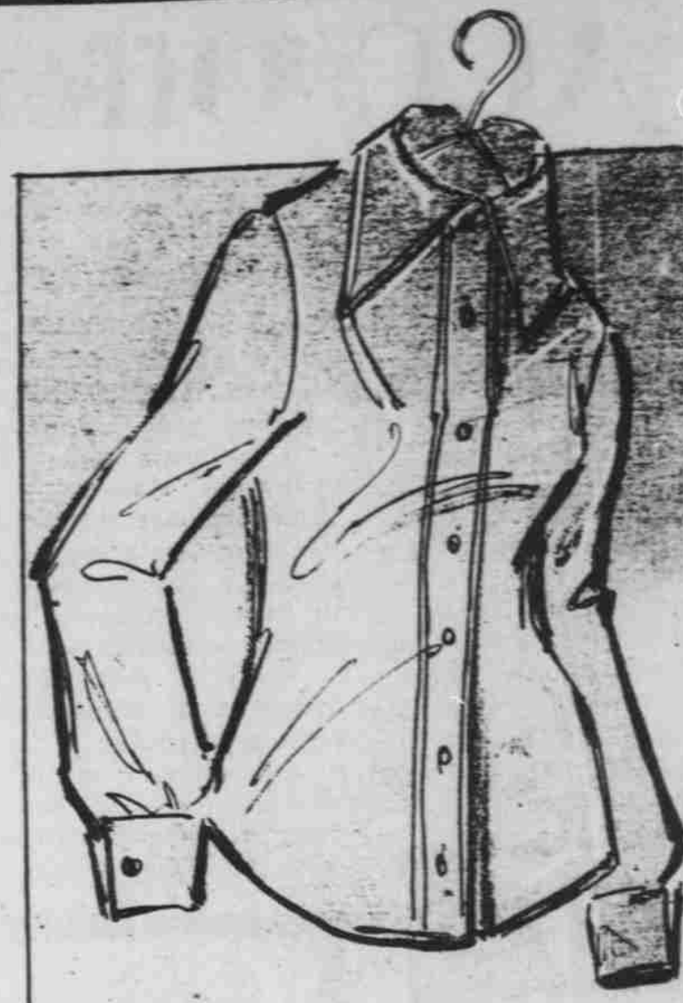
Sharyn Lynn presents the Body Shirt with French cuffs and long collar. Now in white, yellow, blue and bone. at only $7.50 Sizes 7-15

Anyone who can provide transportation for members of the Resurrection City group is asked to contact Whitfield at 933-4121.