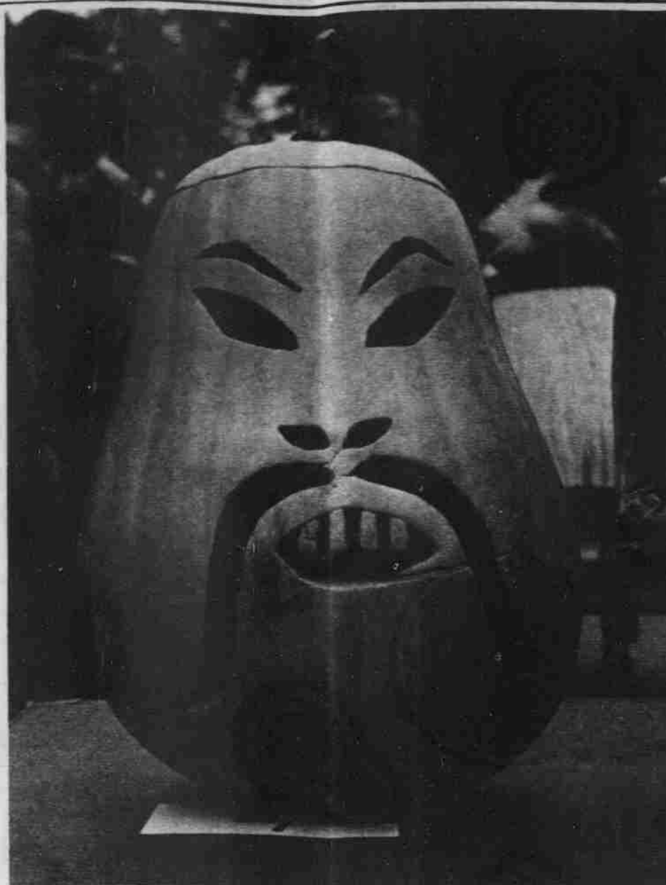
GREAT PUMPKIN CONTEST —The YW-YMCA pumpkin carving contest will be held Thursday. All interested should carve today and bring their creations to Y Court for judging tomorrow.

Old Maps Excellent for Decoupage Priced from 25c to $1.00 The Print Room in THE INTIMATE BOOKSHOP Chapel Hill