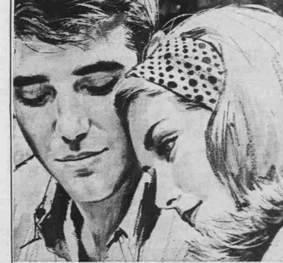
Perfect symbol of the love you share

Being with each other, doing things together . . . knowing that your affection is growing into precious and enduring love. Happily, all these cherished moments will be forever symbolized by your diamond engagement ring. If the name, Keepsake, is in the ring and on the tag, you are assured of fine quality and lasting satisfaction. The engagement diamond is flawless, of superb color, and precise modern cut. Your Keepsake Jeweler will assist you in making your selection . . . He's in the yellow pages, under "Jewelers."