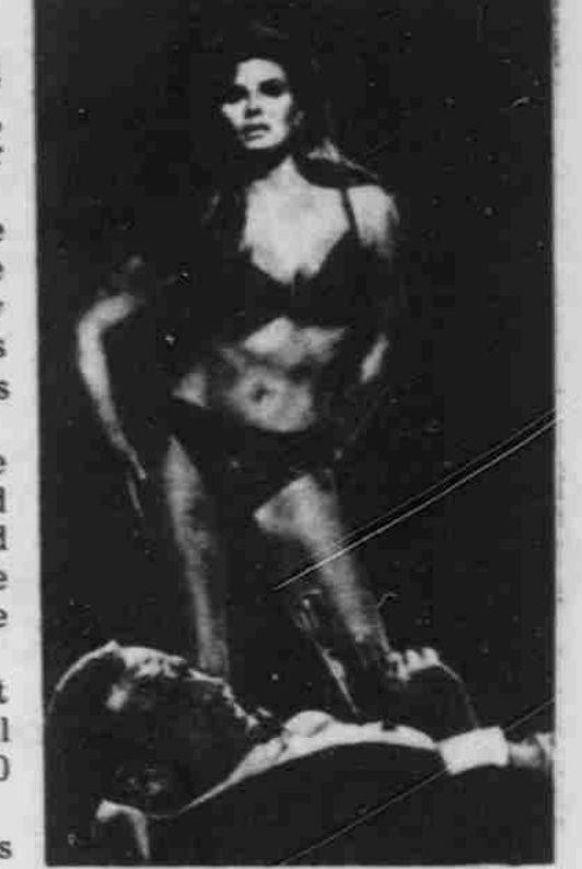
"LADY IN CEMENT"