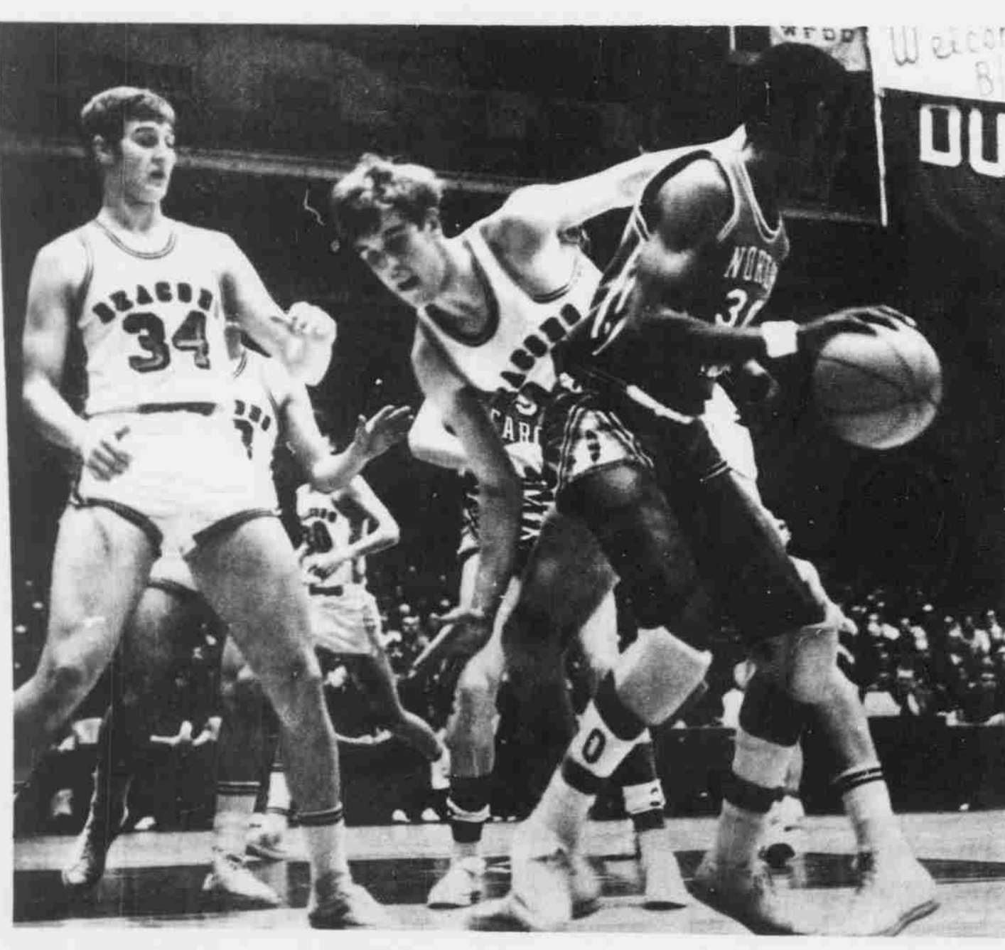
Chamberlain backs up Wake defense.