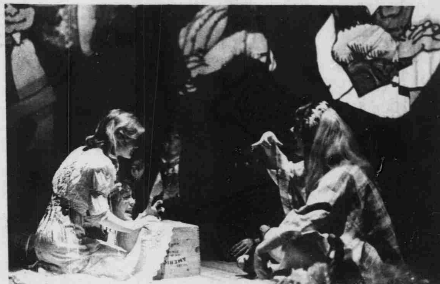
Movies, Lights, Slides, Sound, Music, Dance And Drama Combine

Thompson Theatre is unique in that it is the only group in the Southeast involved in Intermedia on a regular basis. THE ORANGE DRIVER, the Theatre's first experiment in the Land of Intermedia, served to define a concept and to introduce audiences in the area to a bold