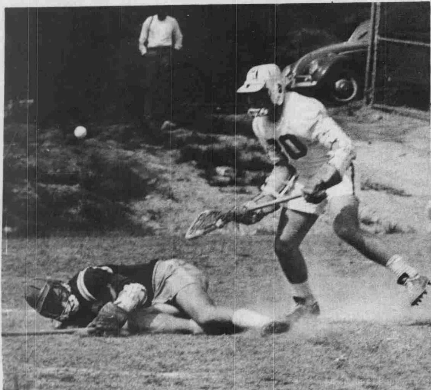
UNC Defender Hits The Dirt UNC Won 14-7.