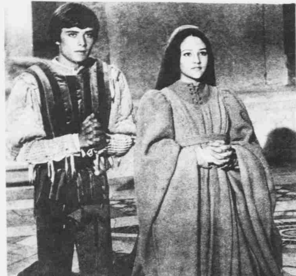
"ROMEO AND JULIET" returns for a second engagement at Chapel Hill's Carolina Theatre this week. The Franco Zeifirelli production won two Oscars—for costume design and cinematography.

VALUABLE BLANKET found Saturday night at Jubilee. Describe it. Call 942-2094, 5 to 7 p.m.