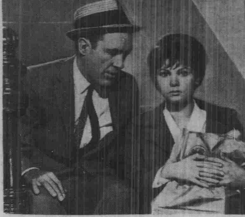
A THOUSAND CLOWNS

ALFRED THE GREAT (M)—The history of England with the accent on religious