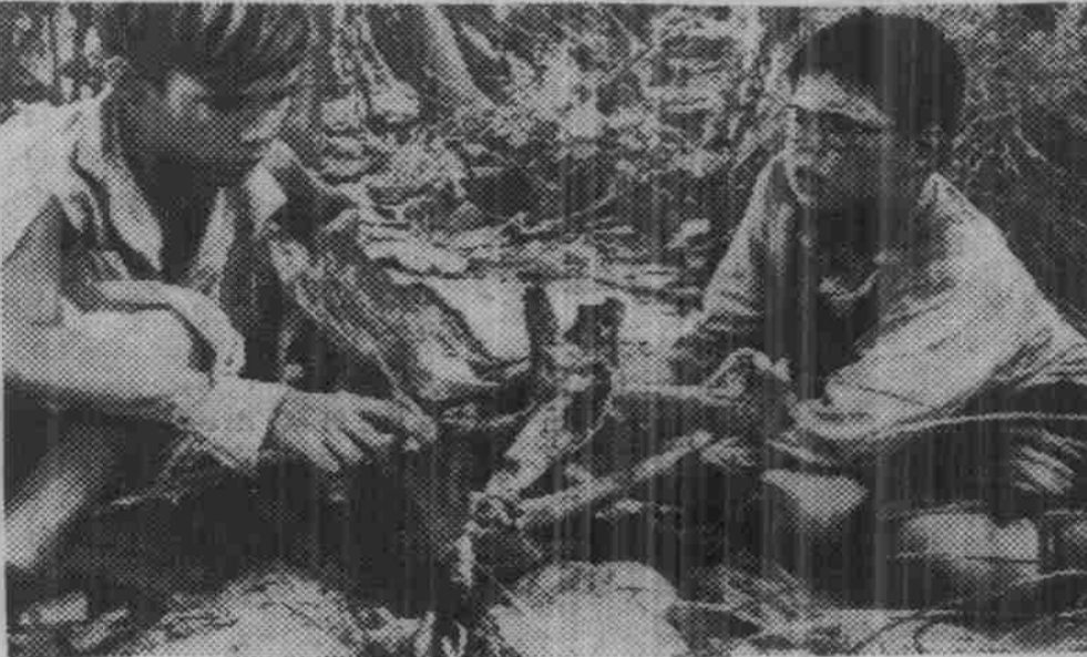
LORD OF THE FLIES