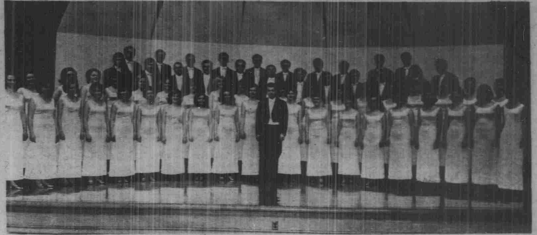
Stockholm University Chorus

Last September, the Chorus opened the Stockholm Music Festival with a work by the Danish composer Langgaard. Although Scandinavian composers are well represented