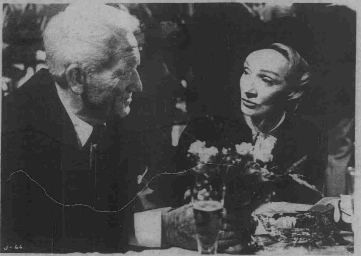
SPENCER TRACY AND MARLENE

flick is A SESSION WITH THE COMMITTEE , at 7, 9:30 and 11:30 p.m.