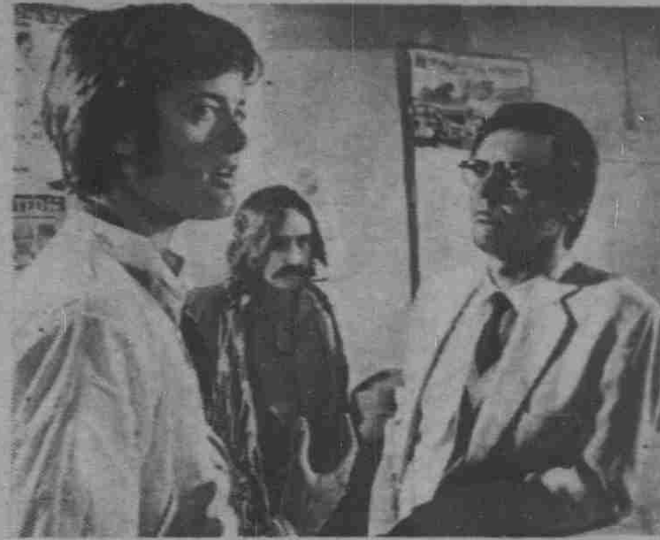
FONDA, HARPER, NICHOLSON

JUSTINE (GP) —Lawrence Durrell's "Alexandria Quartet" has been condensed into one plodding movie that shrouds the mysterious lady Justine in ennui rather than romance. The cast is good (Anouk Aimee, Dirk Bogarde), but the script and direction threw this product awry. (At the Varsity,