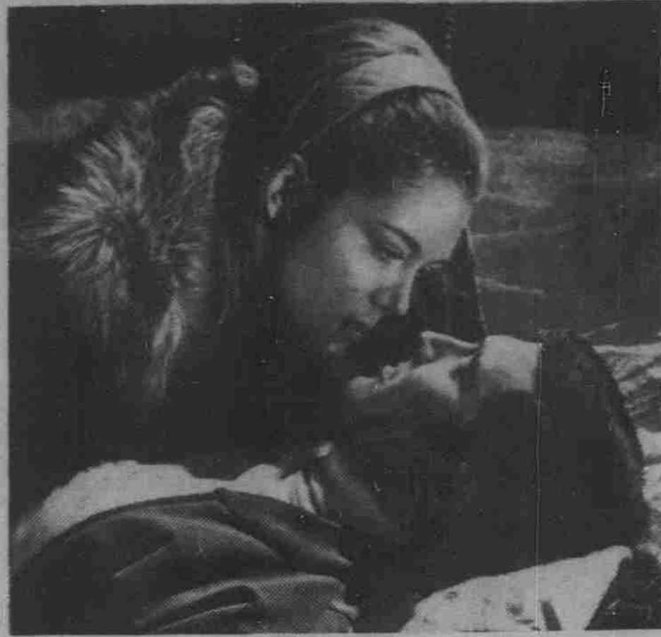
ON HER MAJESTY'S SECRET SERVICE

SCREAM AND SCREAM AGAIN (GP) —Remember those old Saturday afternoon science fiction shows on television, where the plot was deliberately confused, only to resolve in the end of the hour a rather contrived, silly thing that really wasn't worth spending all that time figuring out? Well, just sit and remember and don't bother to go to SCREAM AND SCREAM AGAIN, which is no better. Vincent Price has become a caricature of himself and has