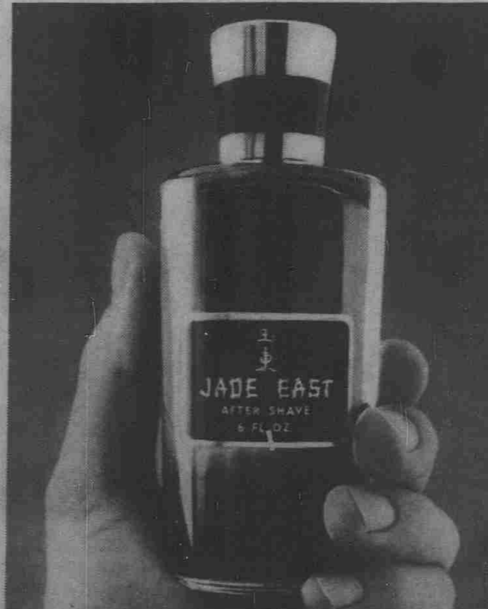
Jade East After Shave and Cologne.