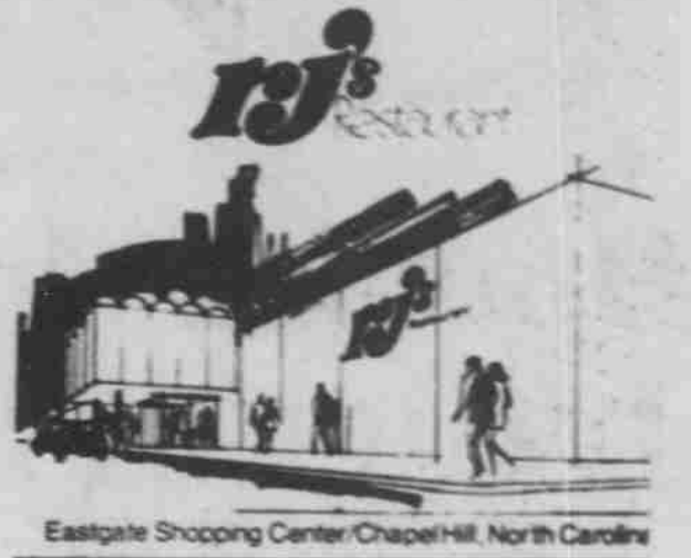
Eastgate Shopping Center Chapel Hill, North Carolina

Some people come to RJs because they are curious. We are curious about why you haven't been.