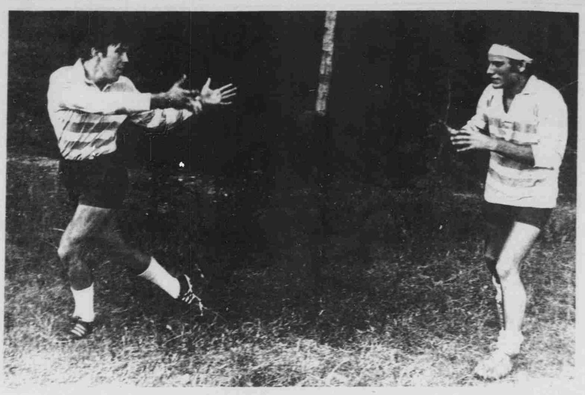
Carolina Ruggers Prepare For Opener Against Davidson