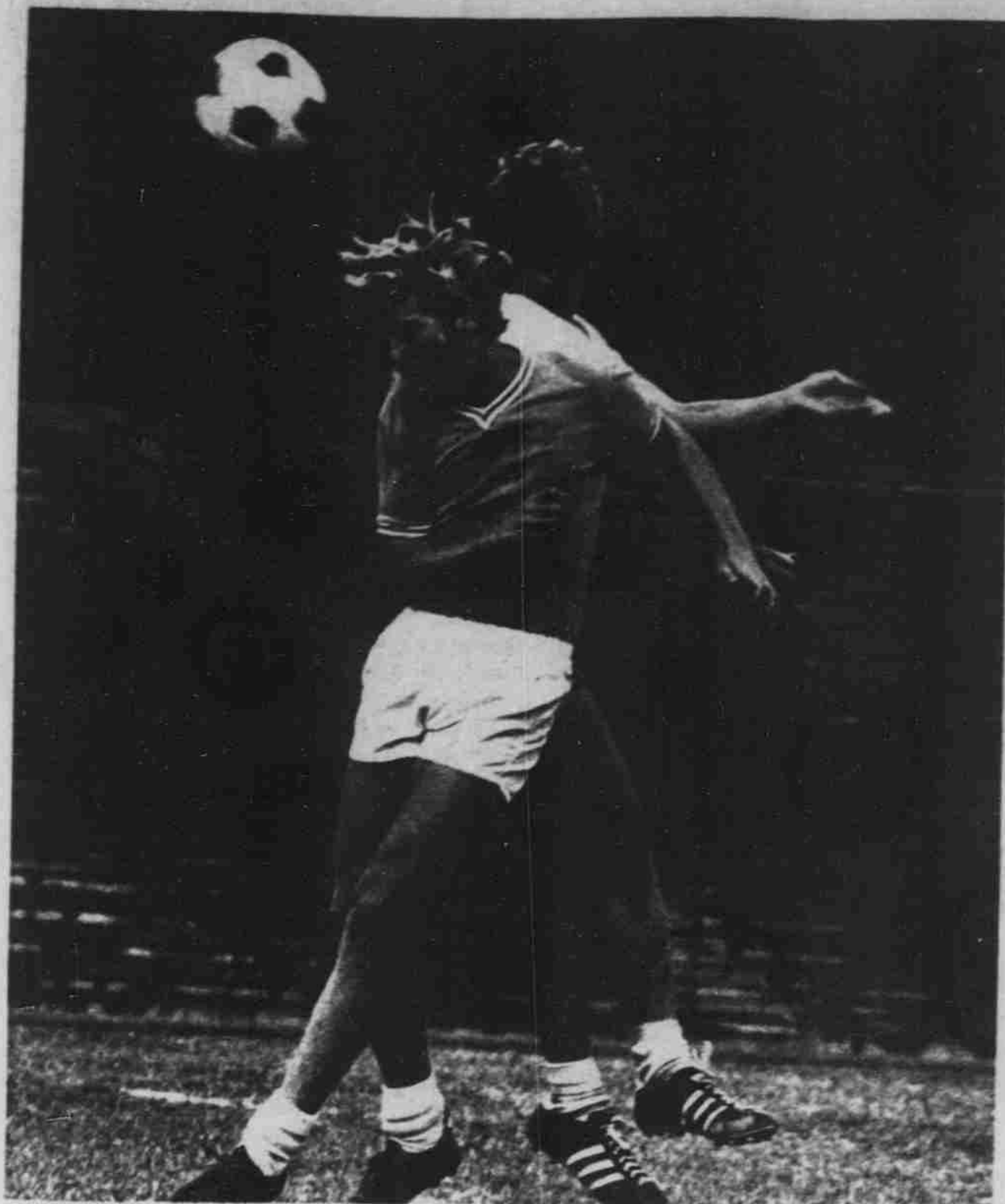
Carolina Frosh Battle Duke Booters