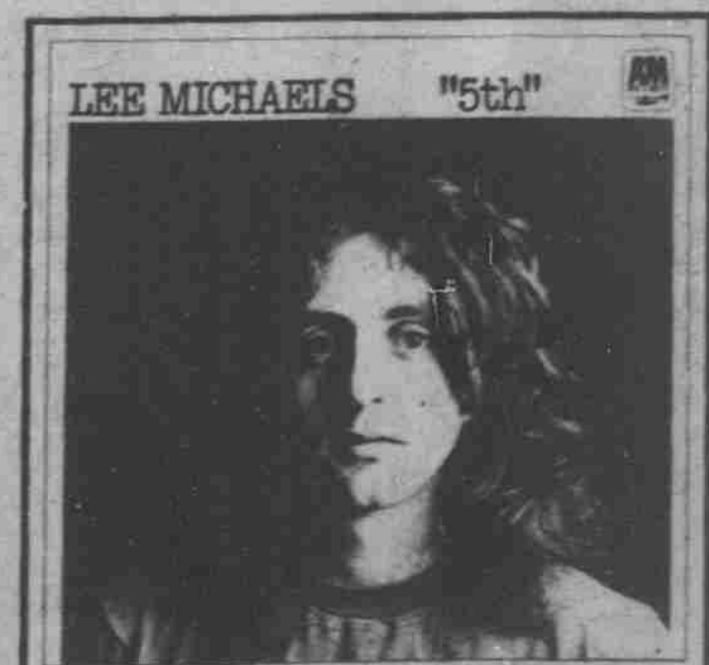
Also New Flying Barrito Bros. And Burt Bacharach—All Should Be Out This Week

Mon.-Sat. 10 AM-10 PM Sun. 1-10 PM 456 W. Franklin St.