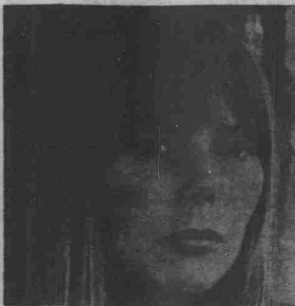
Joni Mitchell's Fourth LP Called "Blue"