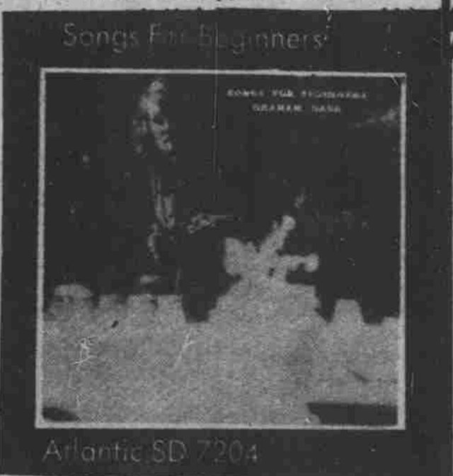
Graham Nash—Coming Soon From Atlantic

First Young, Then Stills, Then Crosby, Now Nash