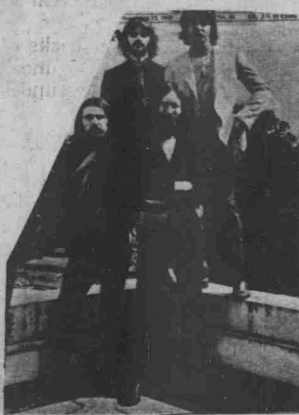
Yep, It's True "Live At Shea Stadium"—A New Beatles Album In Shortly On Import