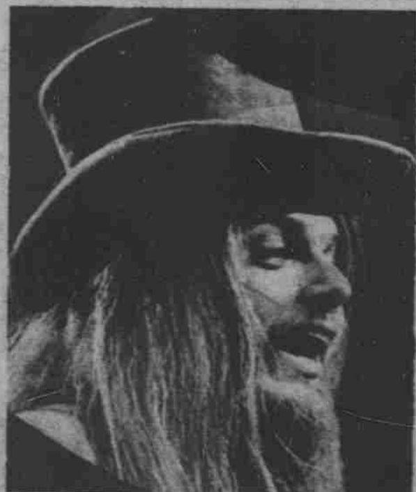
Leon Russell's Long Awaited Album "With Friends And Neighbors" This Week