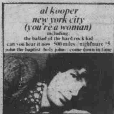
Will BS And T Ever Be The Same