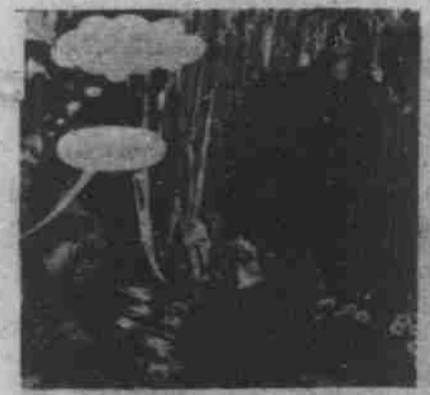
Mike Heron (Of The Incredible String Band) With The Who

First Young, Then Stills, Then Crosby, Now Nash