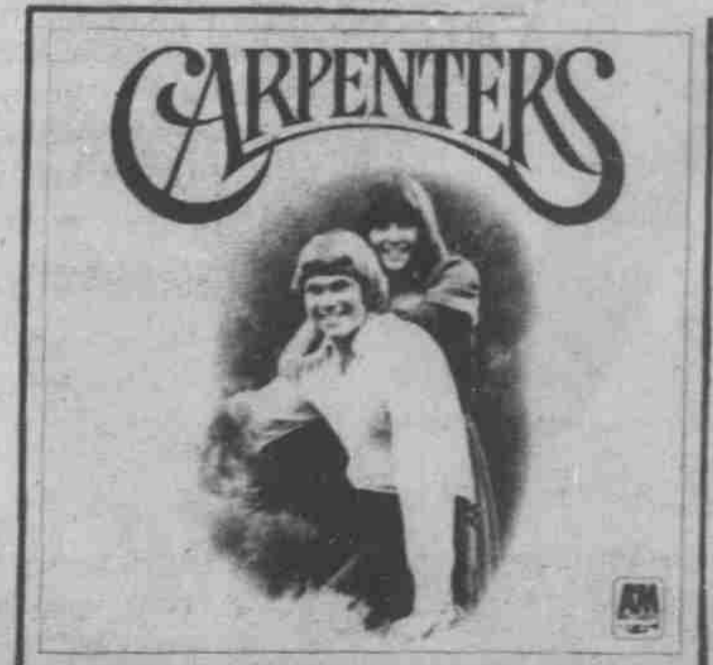
LONG AWAITED THIRD ALBUM