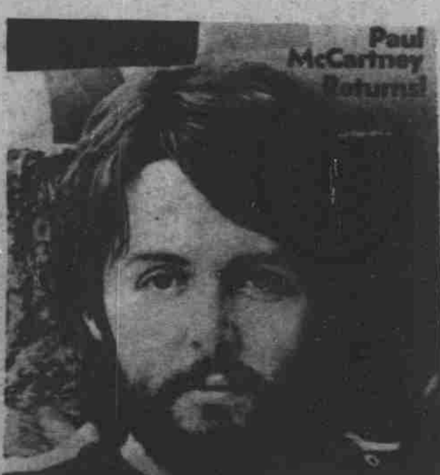
New Album "Ram" With 10 New Songs Later This Month