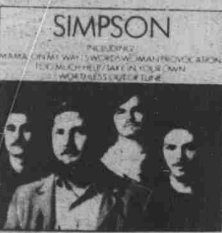
Another Chapel Hill Boy Done Good—This One Is Already In