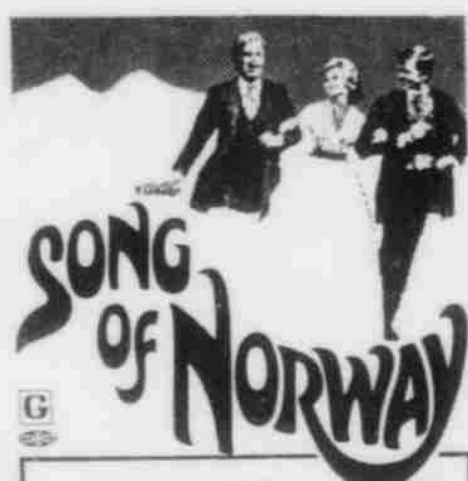
with Florence Henderson

"The MOST BEAUTIFUL MUSIC since 'SOUND OF MUSIC' and the MOST BEAUTIFUL SCENERY EVER ON THE SCREEN"