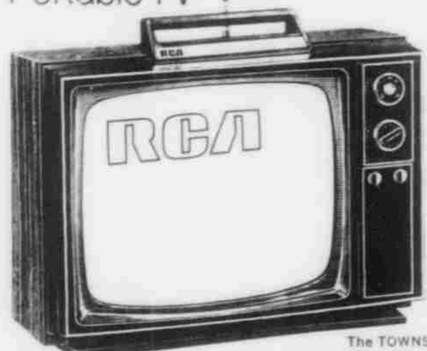
The TOWNSMAN Model AZ-151 15" diagonal picture

$124.95 seems like a small price to pay for a 15-inch diagonal RCA Portable TV