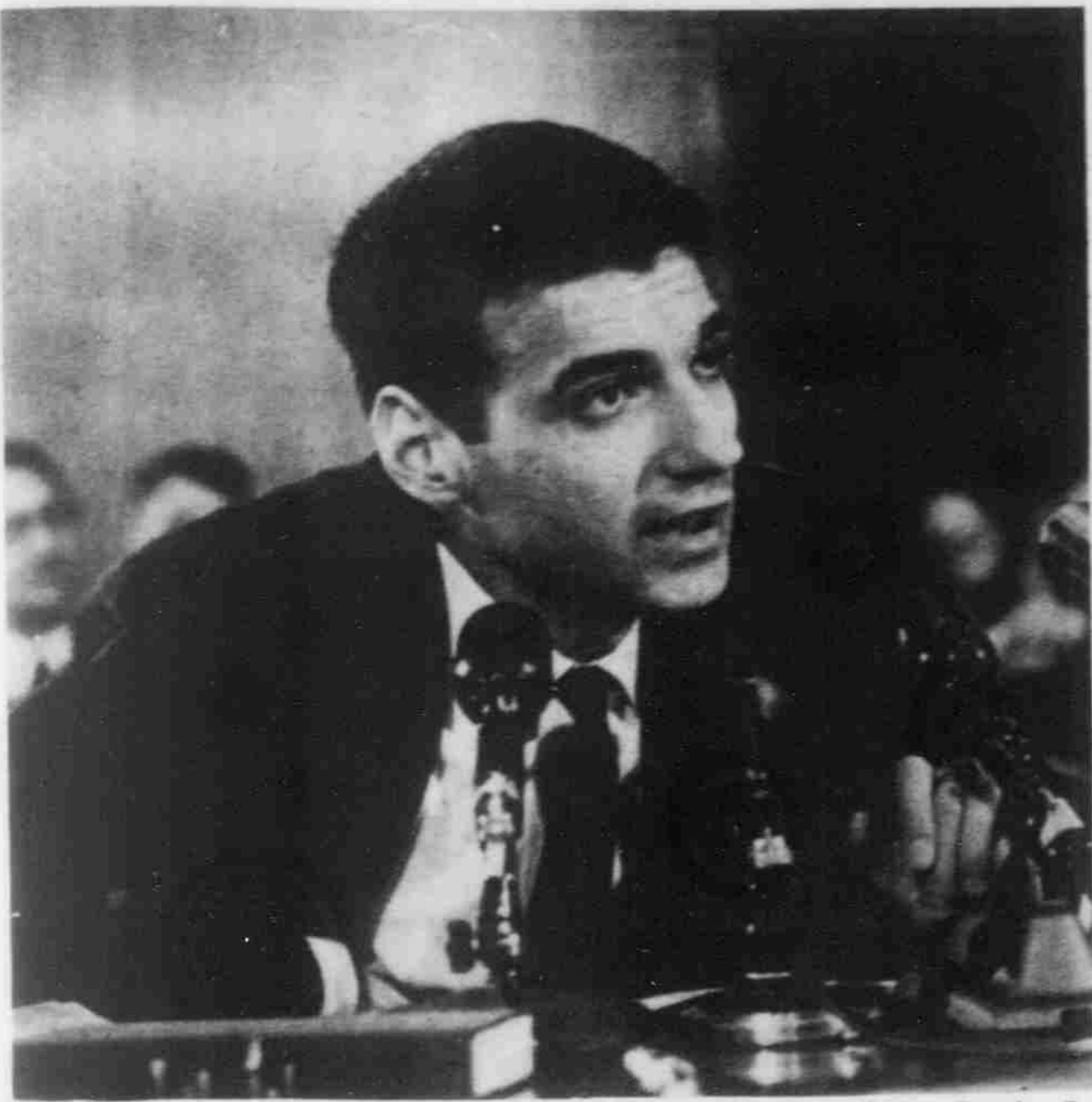
Ralph Nader, consumer advocate, is the first Carolina Forum speaker on October 7. Tickets go on sale today in the Union.

Other speakers in the Carolina Forum series will be Betty Furness, Bella Abrug and Saul Alinsky.