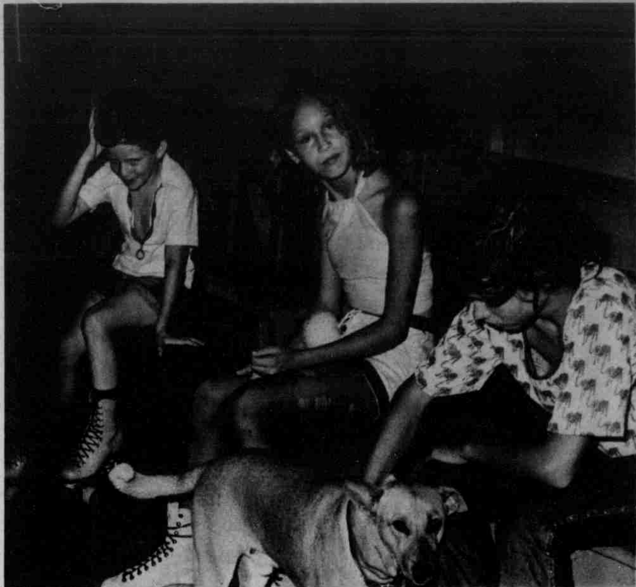
The Daniel Boone Inn Roller Skating Rink offers fun and instruction in skating for all ages, but usually not for dogs. While the gentleman on the left seems ready to go out for another

July 27, 1972 Volume 79, Number 7 Chapel Hill, North Carolina