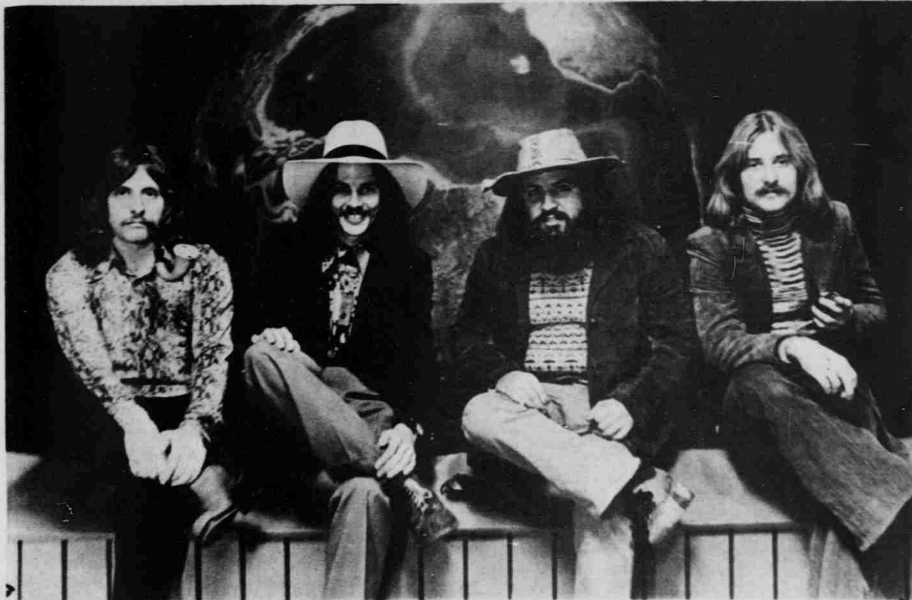
The UNC Men's Glee Club teams with the 'Eye See the Light Show Company' to present a 'PHOTOSpheric Rock Concert' at UNC's Morehead Planetarium. Performances