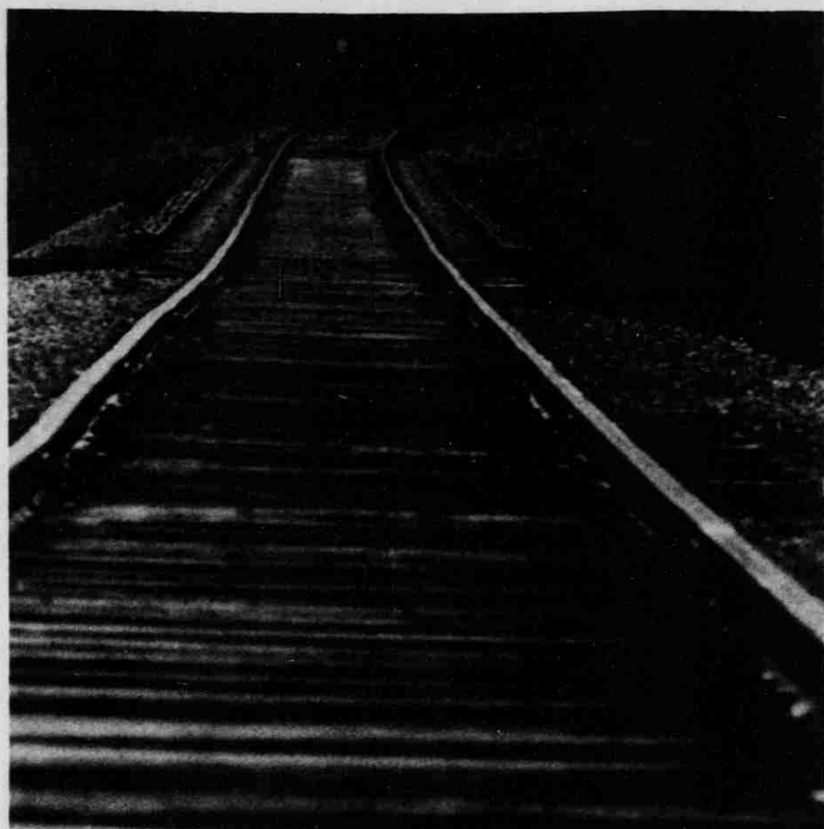
Who knows where one might end up if he were to follow those tracks around the bend? If these rails have that modern malady known as "the disappearing railroad blues", you might not get anywhere.