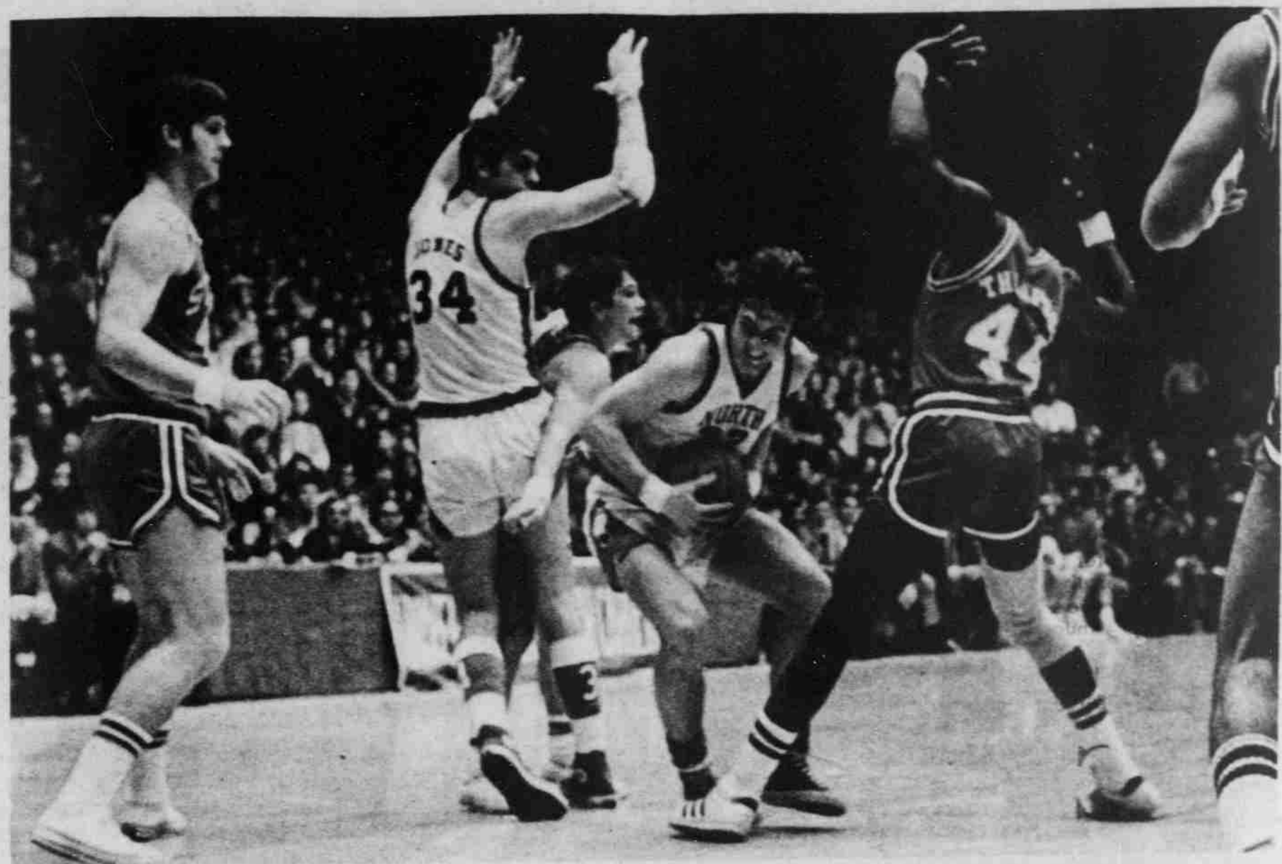
Carolina's winning George Karl tries to get control of the ball and follow Bobby Jones' pick for two points. The Tar