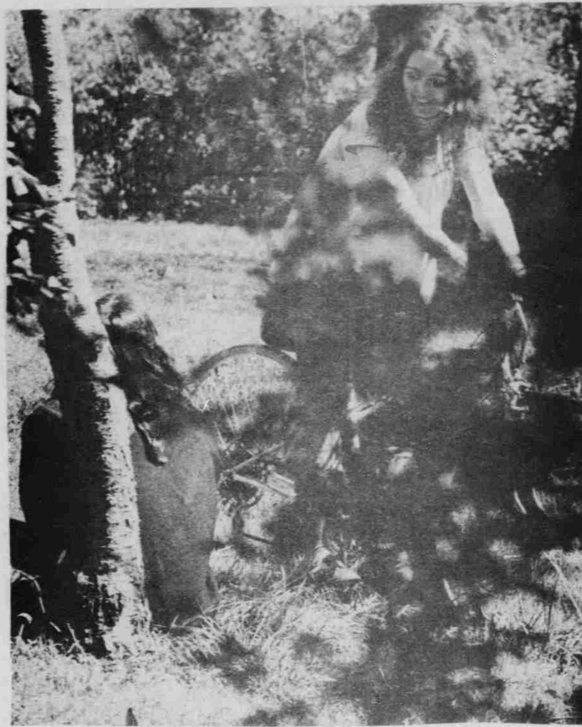
Decisions, decisions . . .