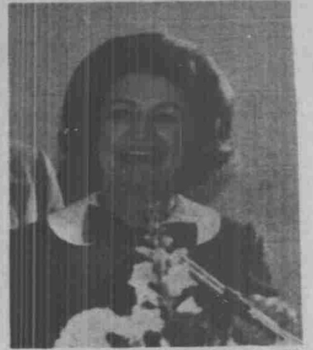
Lady Bird Johnson

She also visited the Carrboro Town Hall and the Carrboro Elementary School Thursday morning.