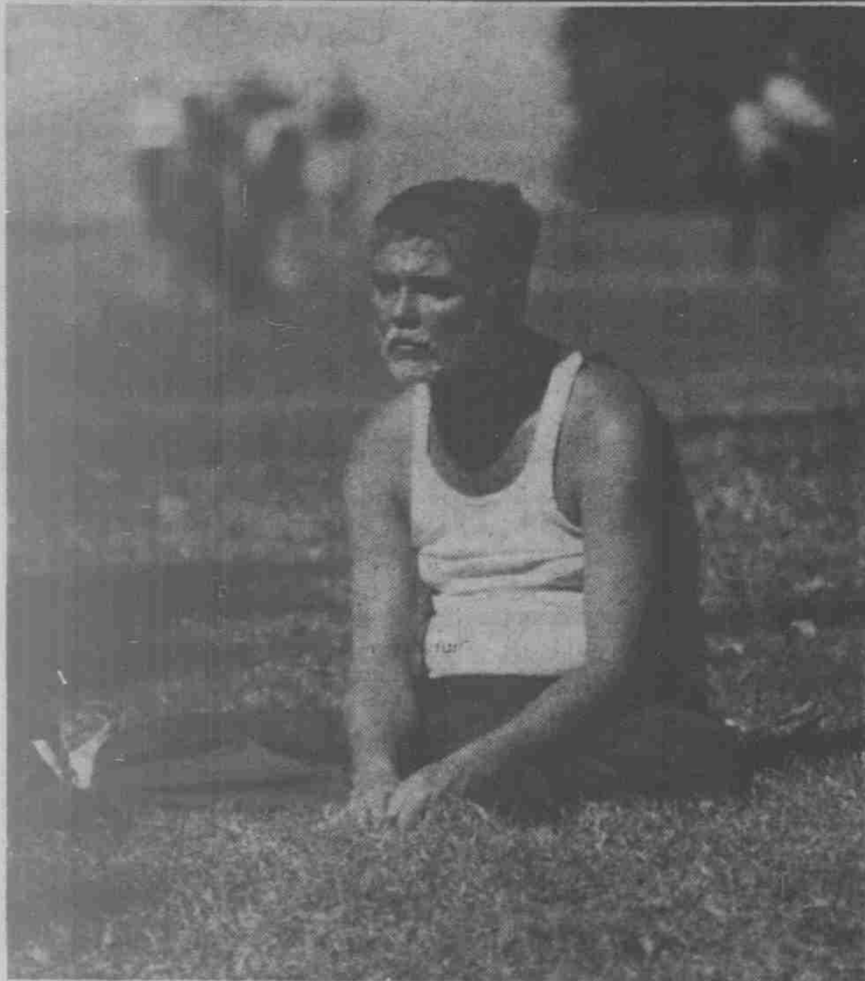
A college campus can be a good place to stop whatever you're doing and take a moment for some serious meditation. While the rest of the University community hurries on its way, a person can ignore the mob and do some thinking.