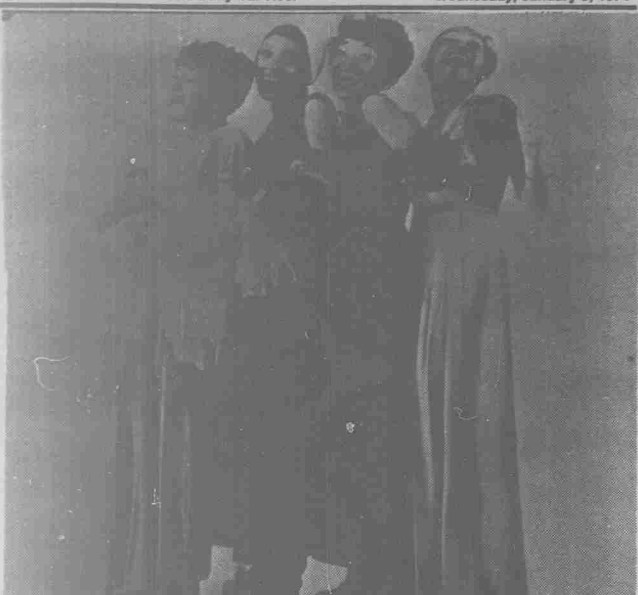
The Pointer Sisters