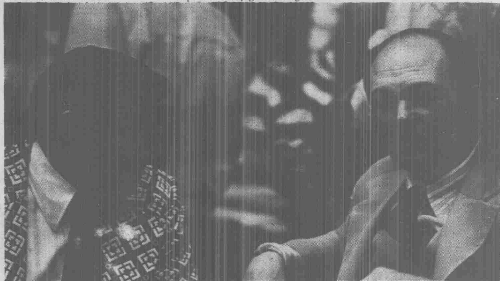
Carolina head coach Dean Smith (on right) and Lefty Driesell, head coach of Maryland, sit and talk before the two team's high-powered match-up last Saturday in Carmichael