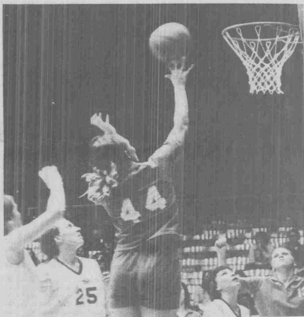
The North Carolina women's team will close out its regular season tonight with a game against Elon College's Fighting Christians at Elon. Admission for Carolina students with identification is free.

"Last week Wake Forest used a man-to-man against us, which really helped us as