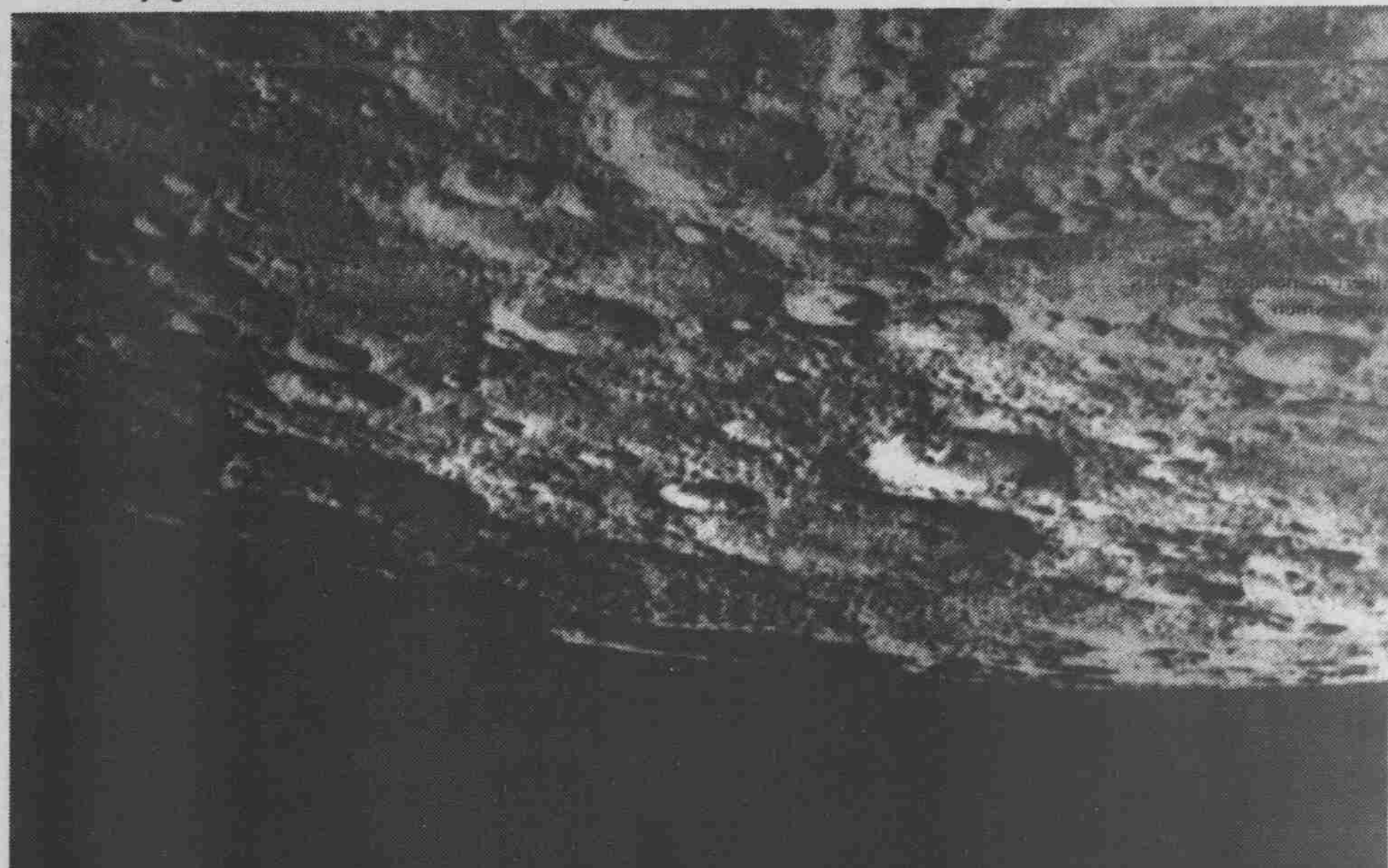
South pole of Mercury

If the dorms sign the contract, they are obligated to purchase the items included exclusively from Friar's Cellar. A final decision on the contract will be made at the next association meeting, to be held 7 p.m. Oct. 3 in Avery basement.