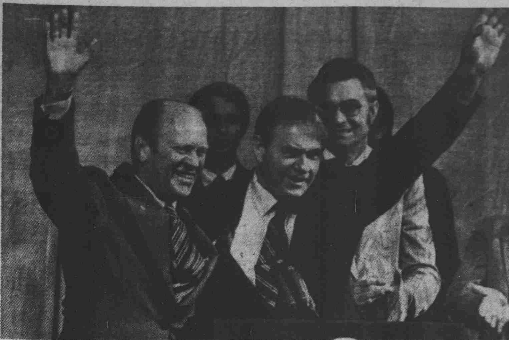
President Ford and Senator Henry Bellmon wave to crowds in Oklahoma City who came to hear Ford speak

In his visit here, Ford hoped to breathe new life into the sagging re-election effort of Republican Sen. Henry Bellmon, a cattleman, wheat farmer and former governor seeking a second term in the U.S. Senate. He is facing a stiff challenge from Democratic Rep. Ed Edmondson.