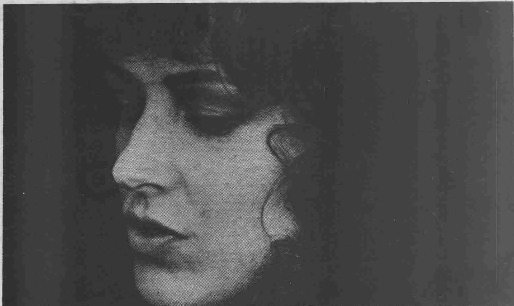
Grace Slick will appear with other members of Jefferson Starship at 8 p.m. Tuesday in Cameron Indoor Stadium, Duke