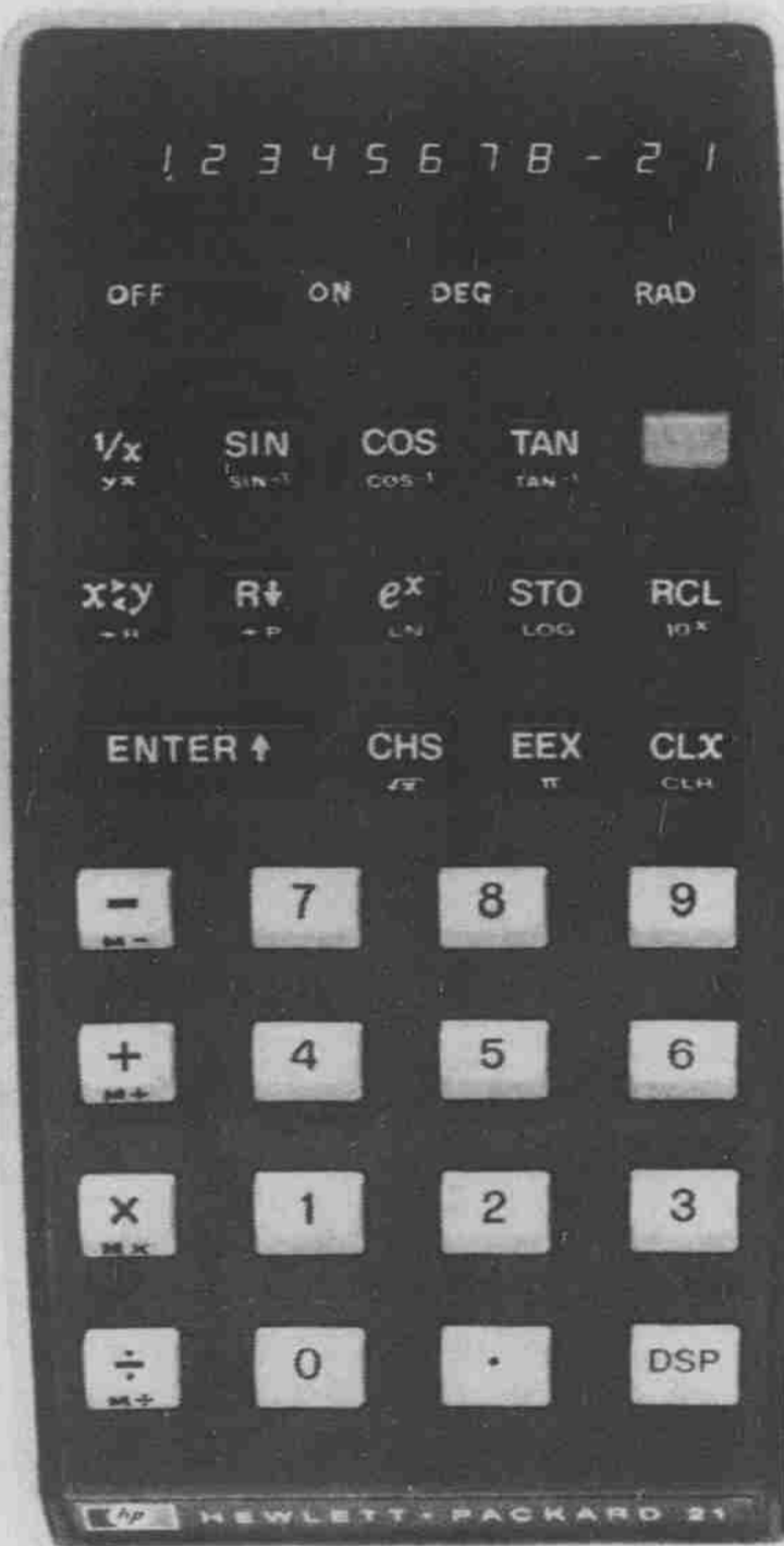
The Hewlett-Packard HP-21 Scientific $125.00*