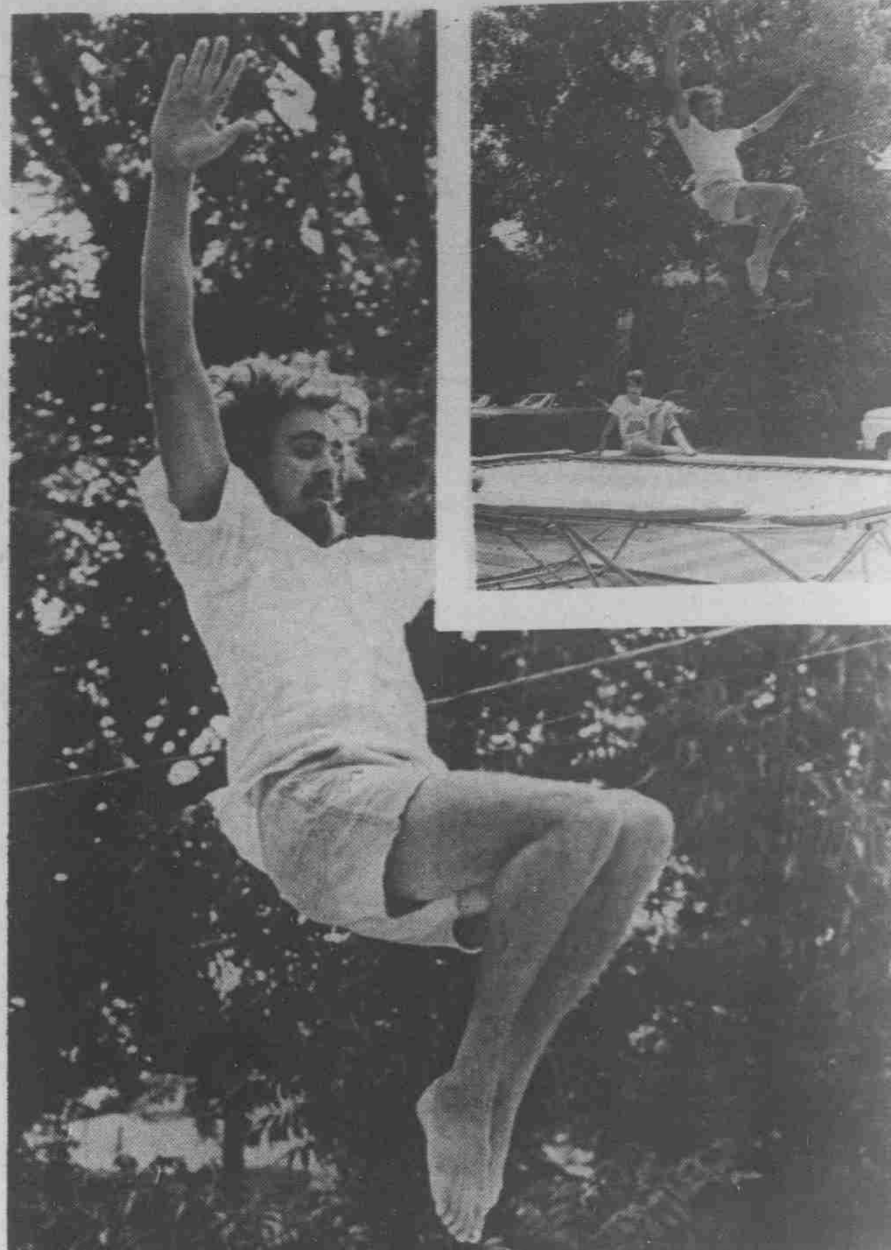
Caught between going up and coming down, this trampolinist seems to be enjoying momentary weightlessness.

In 1972, Silver worked as state finance chairperson for McGovern's presidential campaign and worked in Mayor Howard Lee's unsuccessful bid for a seat in Congress.