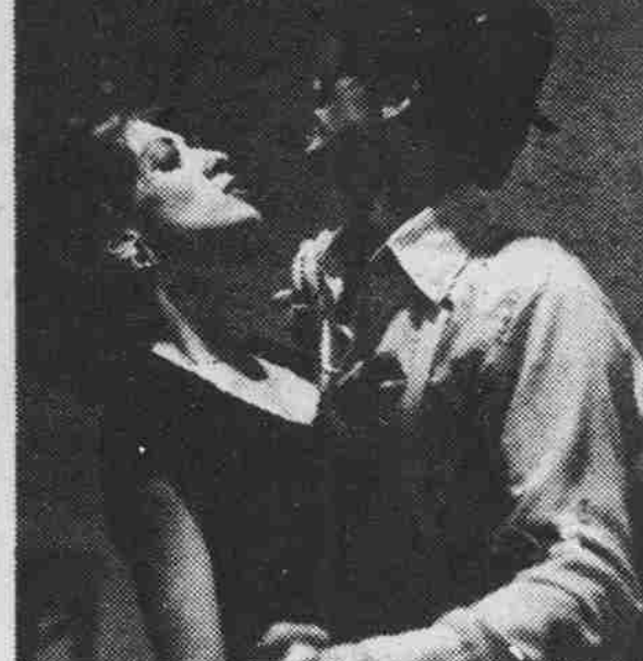
New Performing Dance Company —Jan. 20