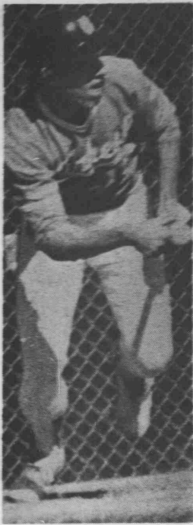
Staff photo by Alan Jemigan

And in the end, you've showed us exactly where we can show our misplaced and nasty attacks on your talents. We're glad we were wrong.