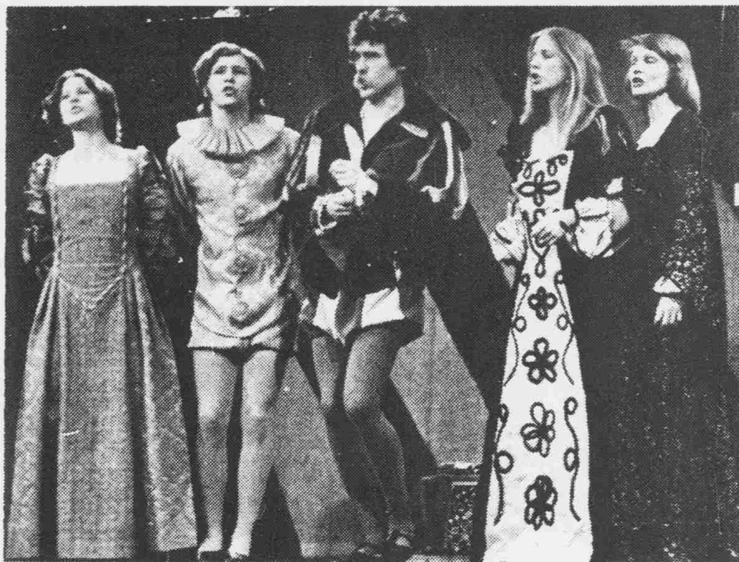
Nymphs and Satyrs, a five member group whose repertoire centers in the Renaissance, will perform their unconventional style of music Monday, June 13 at 8:00 p.m. in the Great Hall of the Carolina Union. Admission is free.