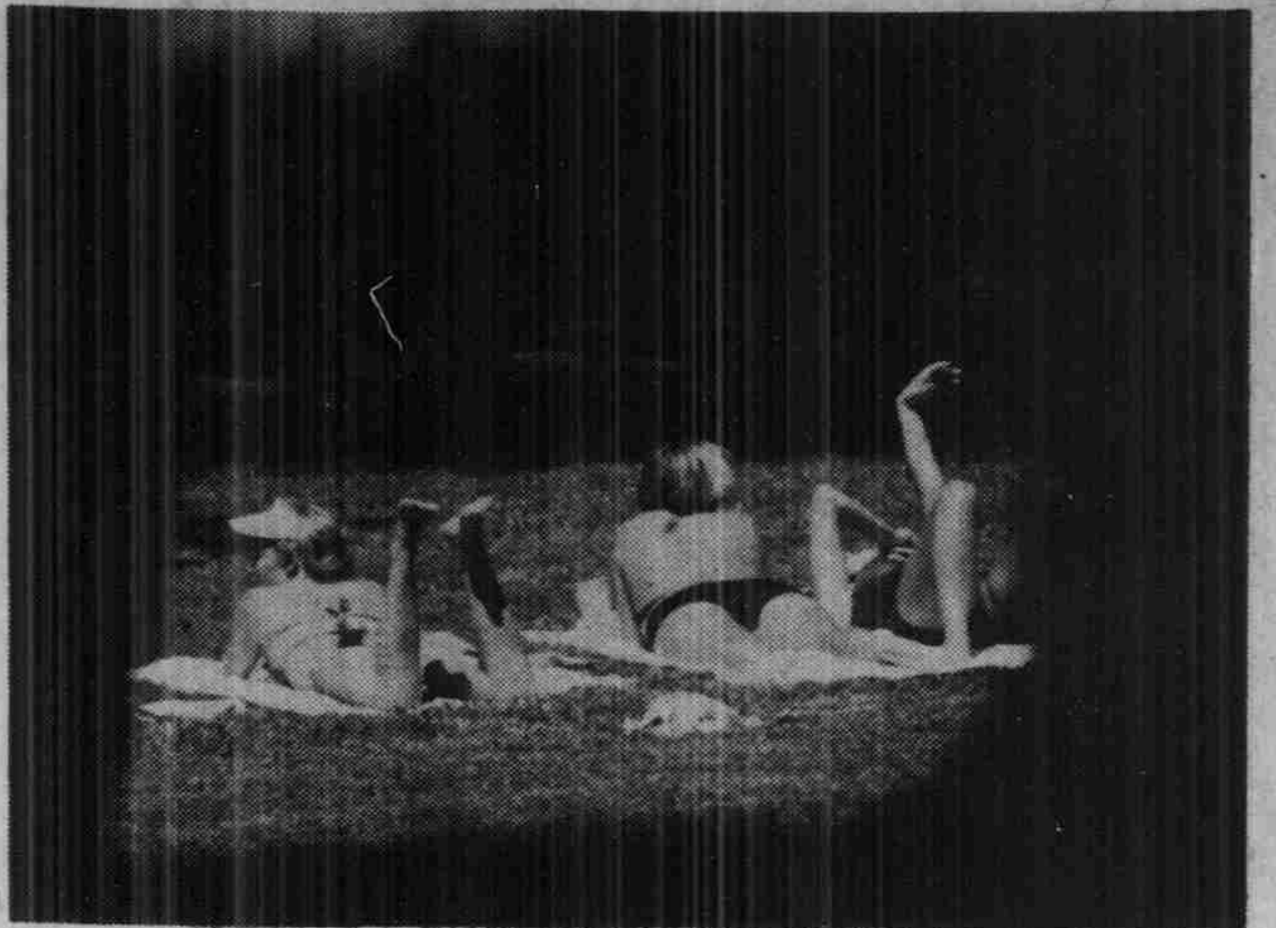
Trees outline sunbathers behind McIver dorm

SCAU's 1978-79 organizational meeting will be held at 4 p.m. today in Room 207 Carolina Union.