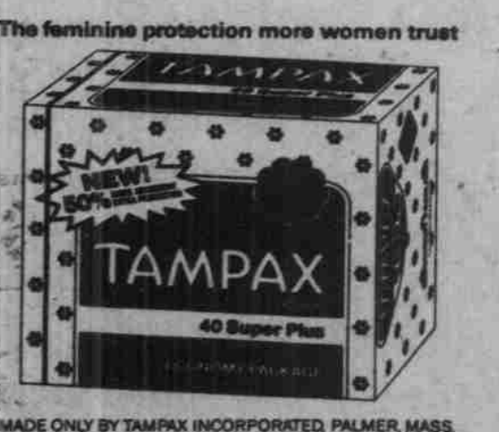
MADE ONLY BY TAMPAX INCORPORATED, PALMER, MASS.

Now, when you need something more, or when you can't change tampons as readily as you like, switch to Super Plus Tampax tampons. You'll feel more secure during the day. And overnight, too.