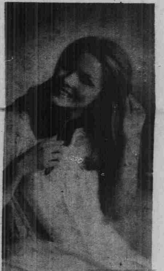
Nightgown by Christian Dior

If you've ever needed extra protection overnight... or on days when your flow is heavy, you'll think Super Plus Tampax tampons were designed just for you. And they were.