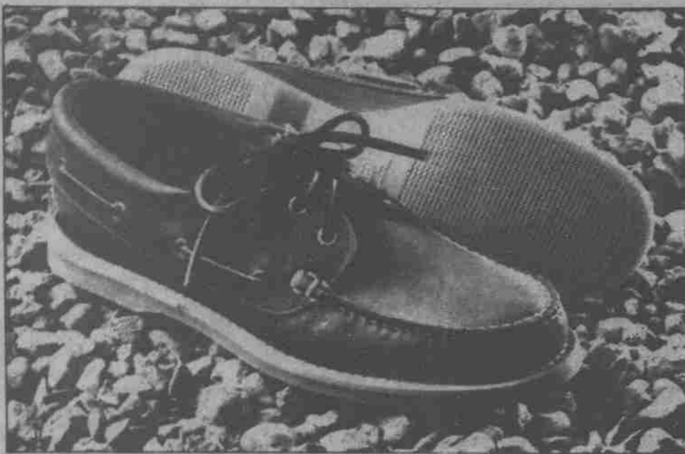
Genuine hand sewn three-eyelet boat shoe, made from the finest quality waterproof leathers. Three-eyelet shoe gives a snug fit with a padded leather collar and tongue for extra comfort. Unique slip-proof, long wearing Timberland®/Vibram® boat sole. Men's leather lined available in rust. Unlined available in dark brown. Women's unlined available in dark brown.

Smooth sailing Timberland® boat shoes are available at: